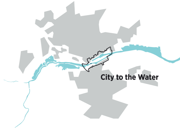
City to the Water - DK's only river city