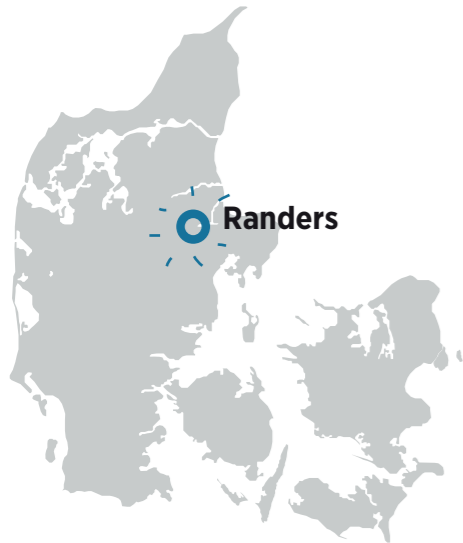
Randers - DK's sixth largest city