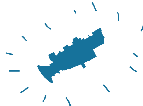
New unique neighborhood