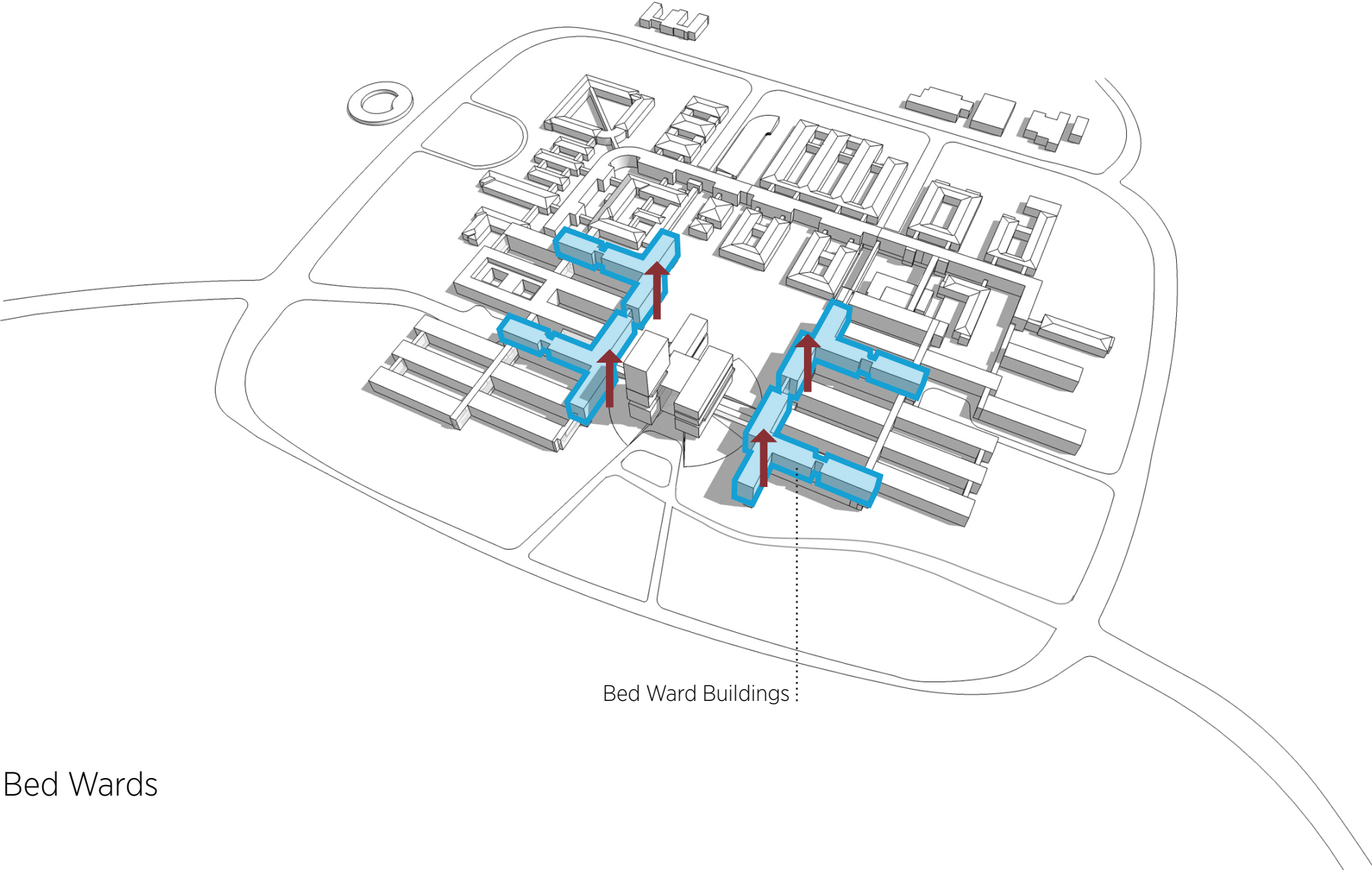
Bed Ward Buildings