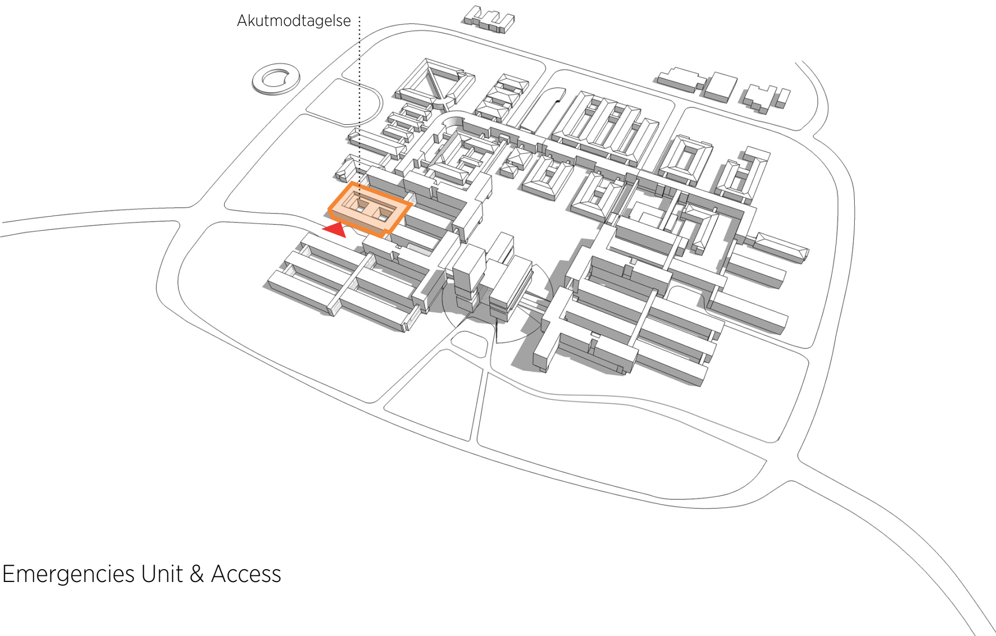
Emergencies Unit & Access